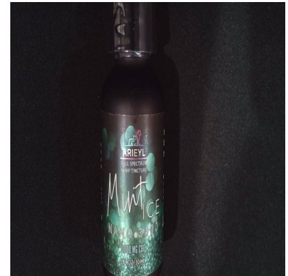
SERVING MASS (g): 1.00 SERVINGS/UNIT: 30